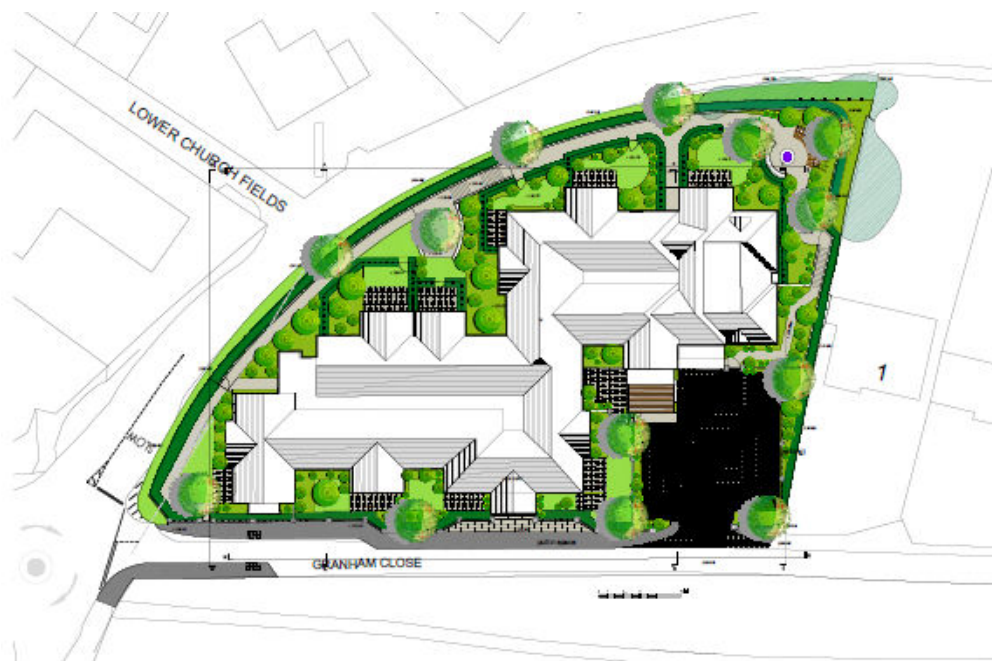
Proposed Site Layout

The application seeks full planning permission for the erection of 27 two bedroom age exclusive apartments for the retirement sector. The development is to be provided by McCarthy and Stone who specialise in the provision of retirement accommodation. The accommodation will be exclusively for those aged 55 and over. The apartments will be self-contained. However, the scheme will include communal areas and a concierge house manager service.